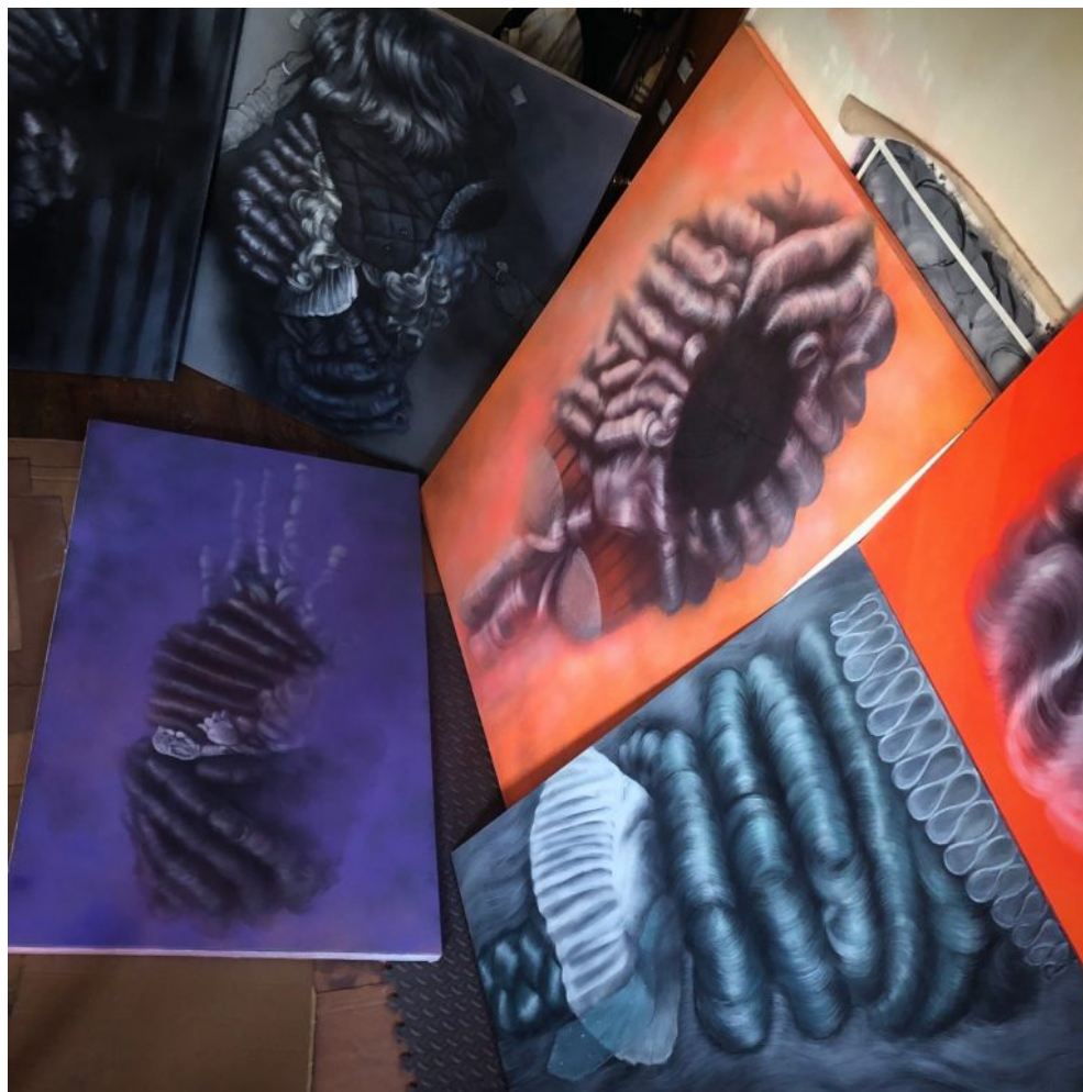
Long Island City, studio view with recently realized paintings.

About the topic instead, I have focused my latest painting on “leftover” of identities. I paint composition of hair, wigs, garments, objects. There is a connection with the animation where the character reenacts certain actions banally connected to the role of women. In one of the actions, the puppet combs her hair with repetitive, disturbing gestures. It’s a way to deal with the conventional idea of female beauty; hair is such a big part of it. It has been considered an element of power, of sensuality, of chastity sometimes.