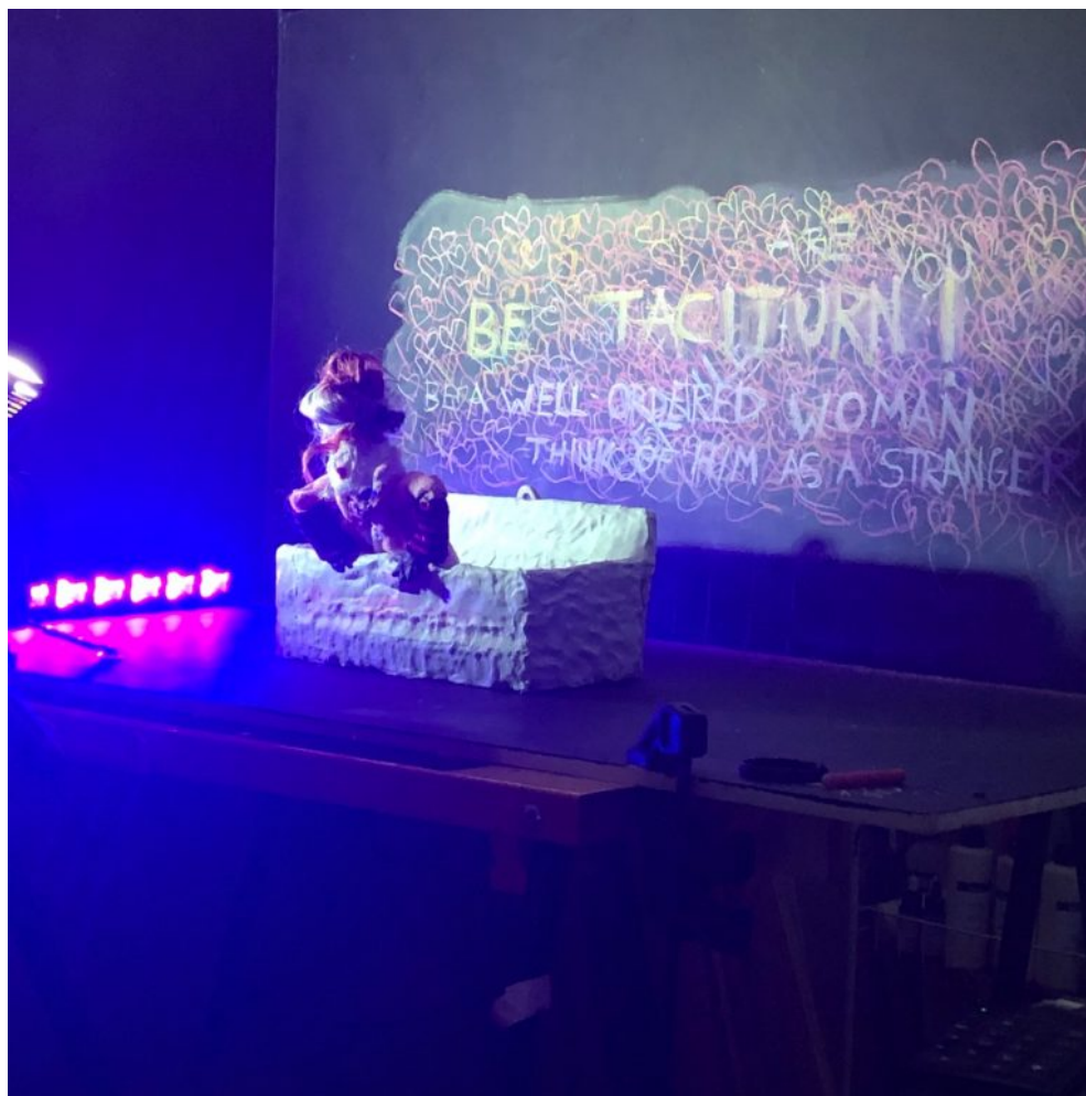
Studio setting to realize My Hope Chest, Long Island City 2020. Courtesy of the artist